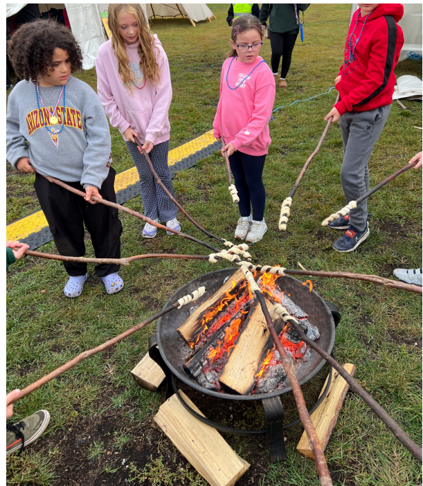
Grade 5 students attend the ATC festival on the Snye in September.

Our options classes have started up again for grades 4-6. Once a week for an hour, students get a choice of which elective class they would like to attend for the semester. Offerings include art, movie making, Minecraft, drama, board games and more!