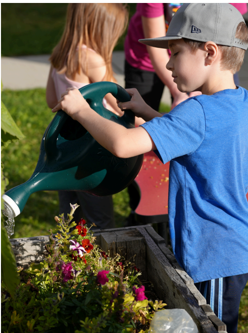
Gardening Club kicked off in September, with grade 2s and 3s harvesting sunflower seeds and clearing out the garden beds for the winter.

Once again our Cougar families have come through with an amazing turnout for our Annual Terry Fox Walk. We smashed our original fundraising goal of $2400 by raising just over $3500 this year. Way to "Be Like Terry!"