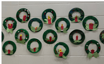
Holiday themed art in the hallways during December.

During our Christmas concerts, we also auctioned off VIP parking spaces, which raised $615 for the SPCA, and we raffled off tickets for the Best Seat in the House which raised $1000 for the Center of Hope and $1000 for Waypoints.