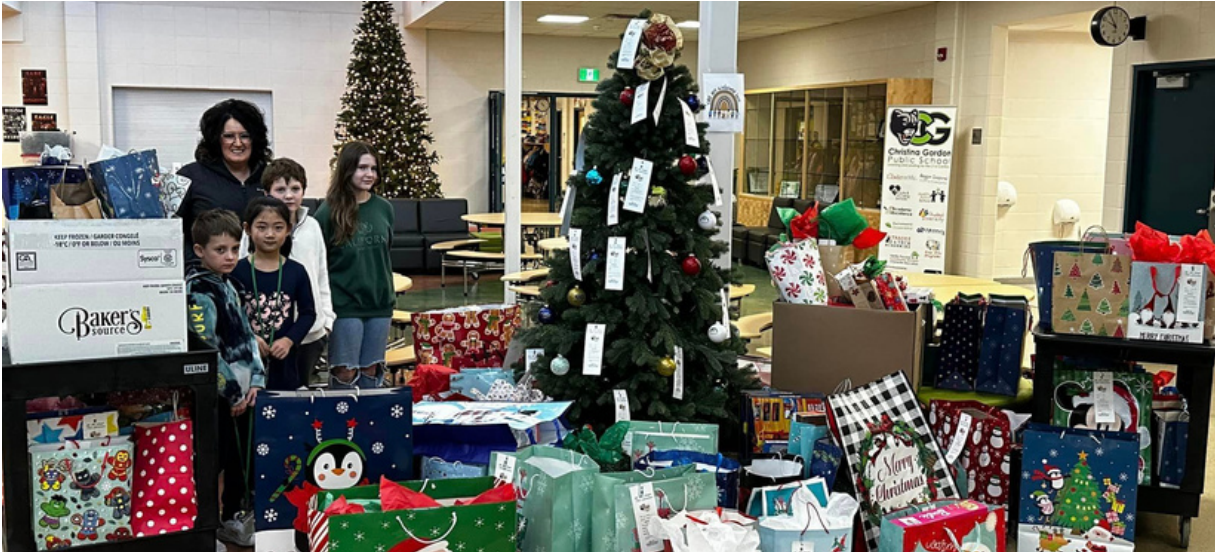
Student leaders help to load our angel tree gifts for the Salvation Army.