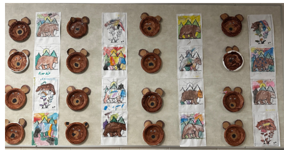
Bear Art from our Div 1 Hallway

In addition to fearlessness, the Bear also teaches us the importance of love and acceptance. Bears welcome everyone with open arms, but they are also willing to stand up against any obstacles to protect what matters most.