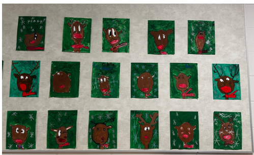
Grade 2s made reindeer art in December

Habit 2 means to Begin With the End in Mind. Through this, we learn the importance of setting goals and planning ahead to achieve them. This habit encourages us to think about both short-term and long-term goals. At CG, we encourage students to set meaningful goals for themselves and their home, community, or school. We understand that everyone has areas where they can improve. It could be focusing on our work in class, remembering to brush our teeth at night, or being kinder to our siblings. Everybody can choose one thing you want to do better. Start taking action towards that goal, and soon you will start to see the results!