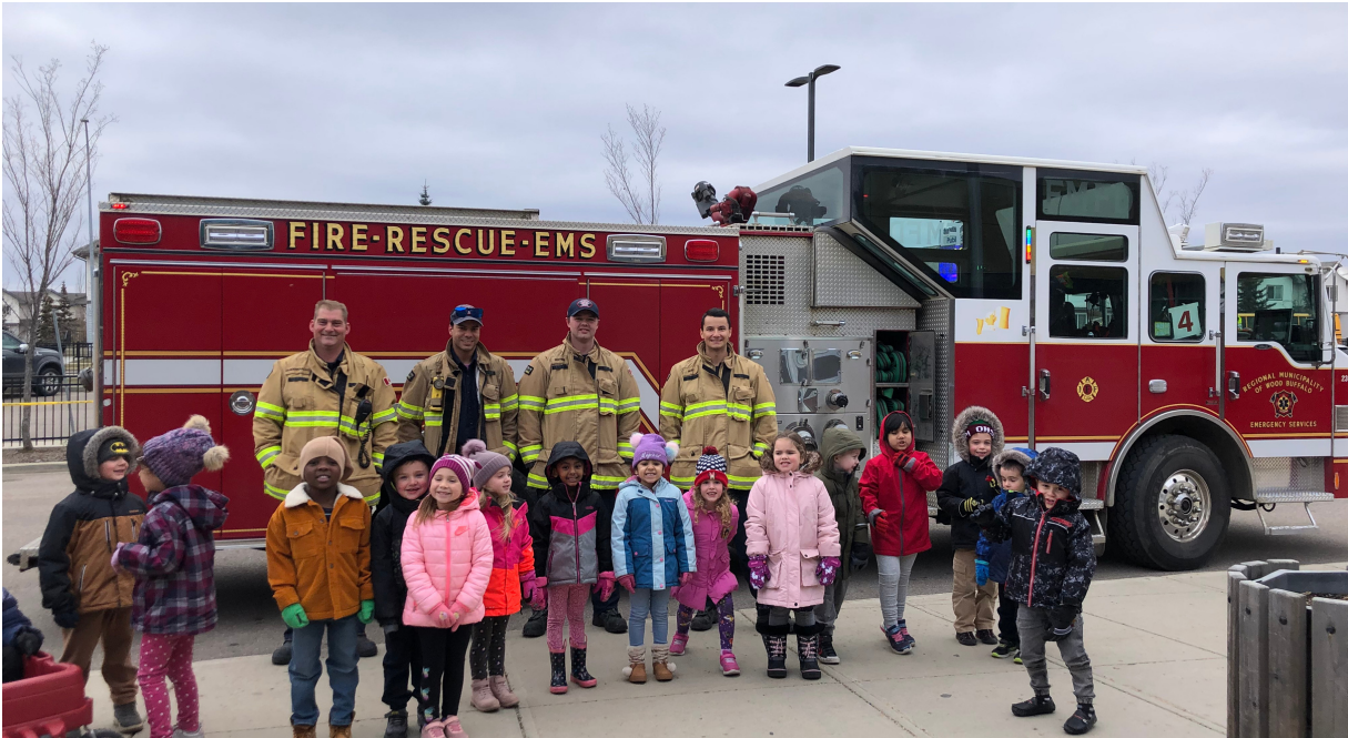
Kindergarten class visits with our local fire department for Fire Safety Month