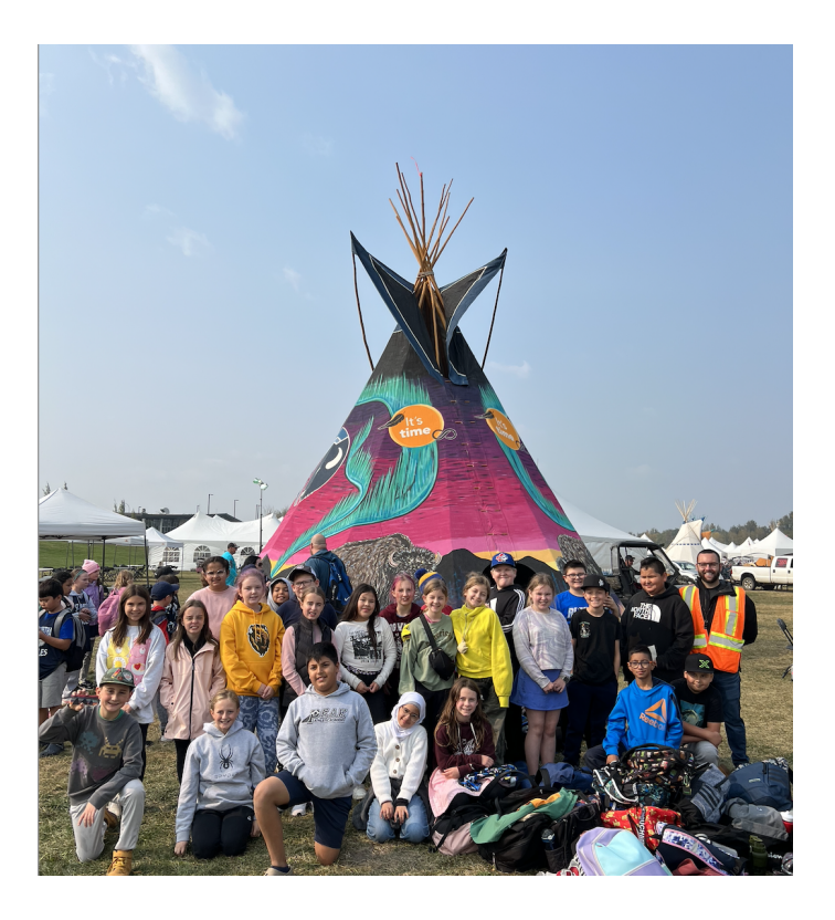
Grade 5 students attend the ATC festival on the Snye in September.

Early Learning 8:40 am Morning classes start 11:25 am Morning classes dismiss 12:30 pm Afternoon classes start 3:15 pm Afternoon classes dismiss