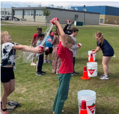
Students play games during our annual year-end Field Day