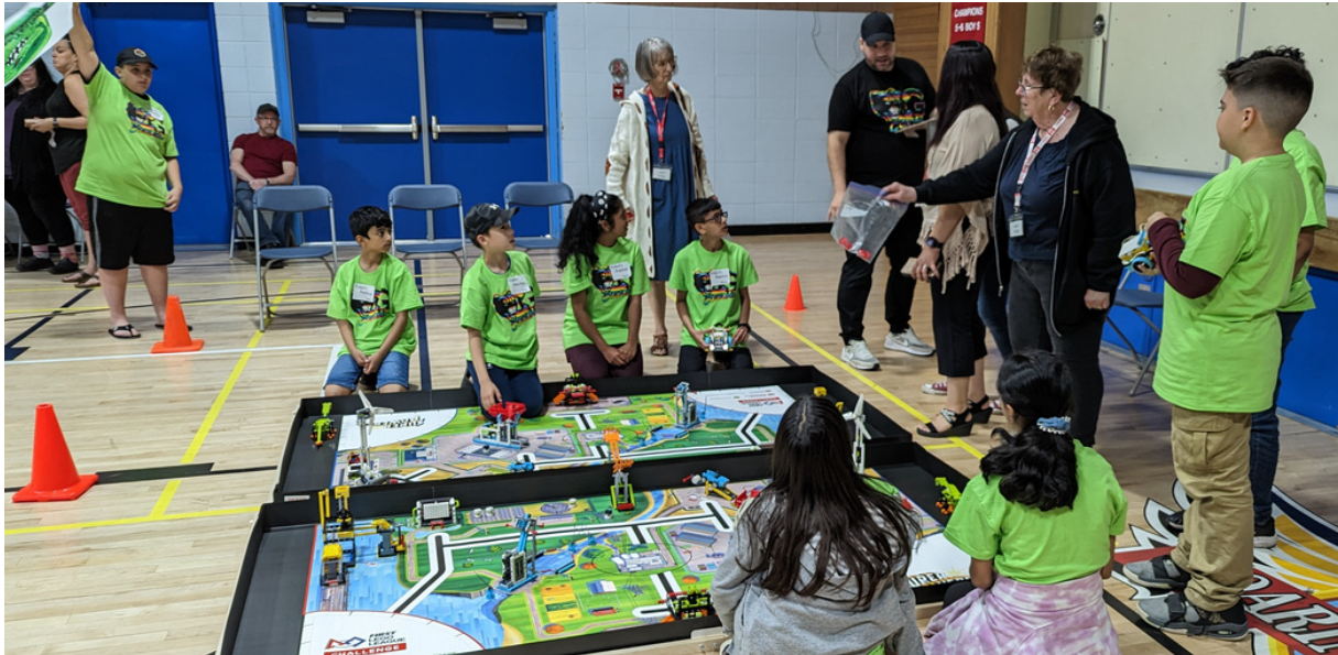
Student put their robots to work at the June 3rd Robotics competition.