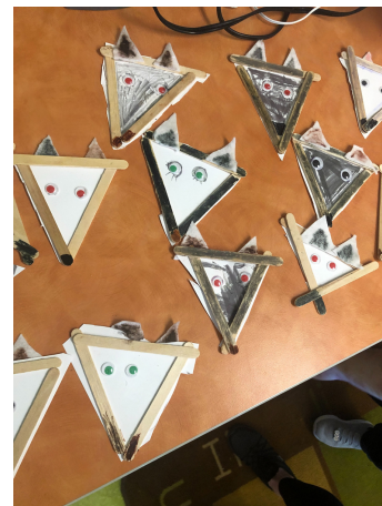
Grade 3 students made these Wolf art pieces as they learned about the wolf teachings this past month.

In the Seven Sacred Teachings, wolves represent humility because they live in packs and depend upon each other for survival.