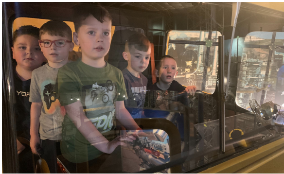
KG students enjoying a visit to the Discovery Center in February