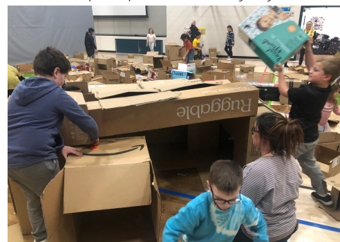
Students participate in Global Play Day

Grades 4-6 were super lucky to have two excellent days of skiing in January! Mild temps meant lots of smiling faces, especially since this was the first ski trip in three years. Many students have already returned to the ski hill on their own, having discovered a new passion. Thank you to the parent volunteers who helped out!