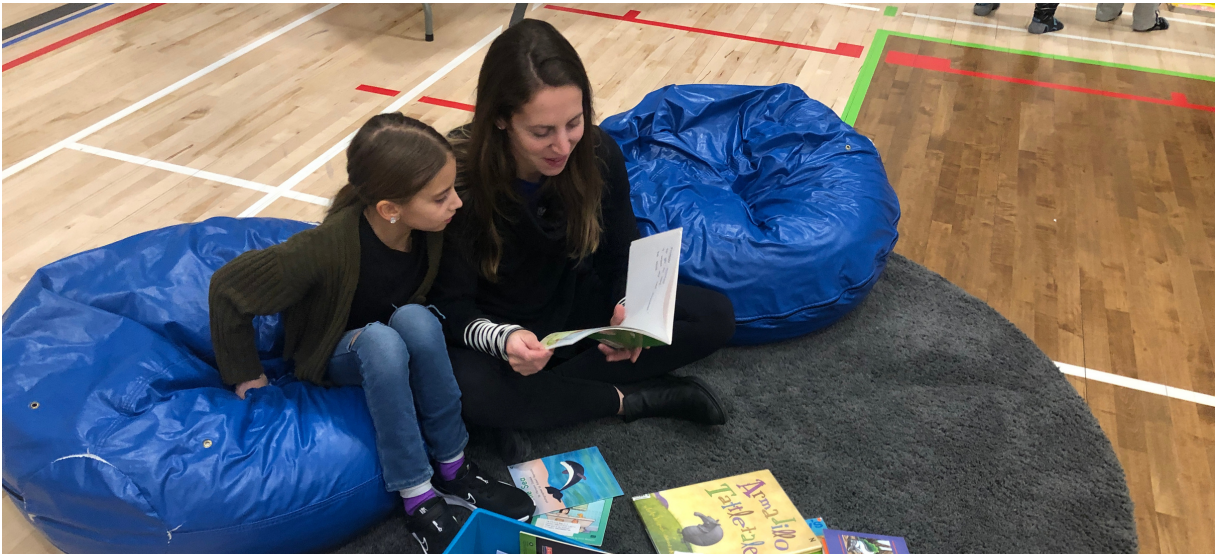
Guests take time to enjoy some comfy bean bags and the reading station at Family Literacy Night.